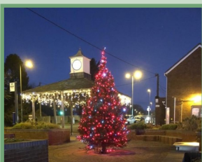
Christmas in Four Marks

2021 saw the return of both the Four Marks 10k, although this year held in September instead of July and the Remembrance Sunday parade and service at the War Memorial. Four Marks is now also lucky to enjoy the hugely popular Watercress Line Steam Illuminations as part of the Christmas celebrations.