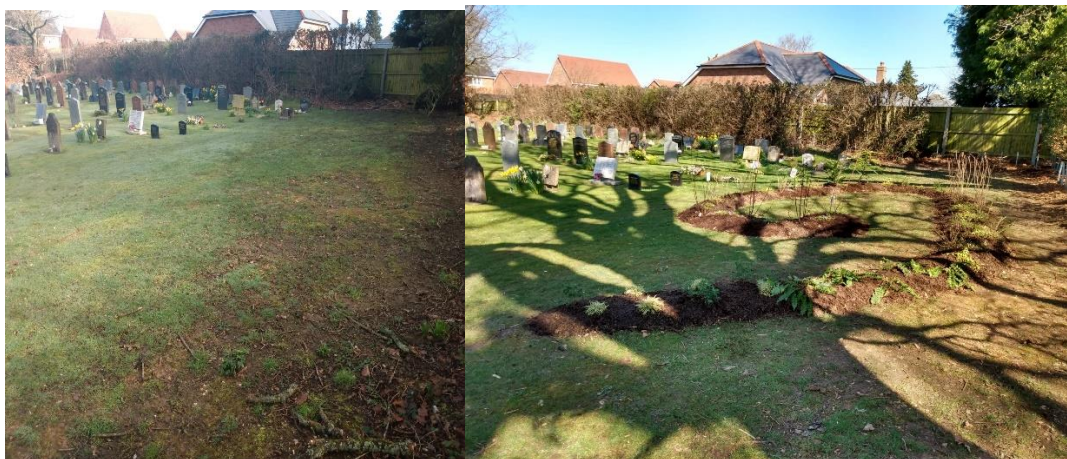
Before and after at Cemetery