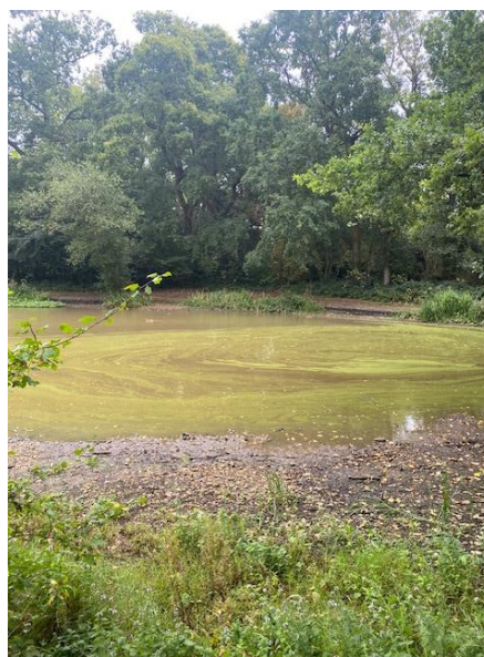
Green surface on pond.