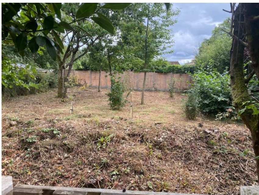
Badger Orchard strimmed by the Lengthsman.