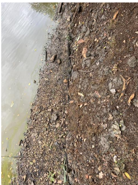
Revetments at Swelling Hill Pond.